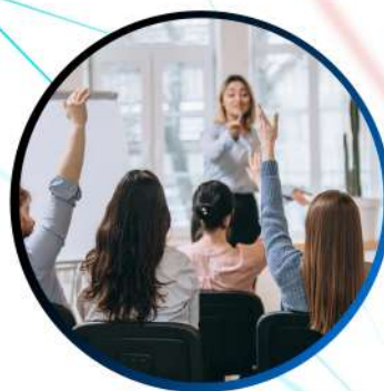
Insights from Top IT Mavens