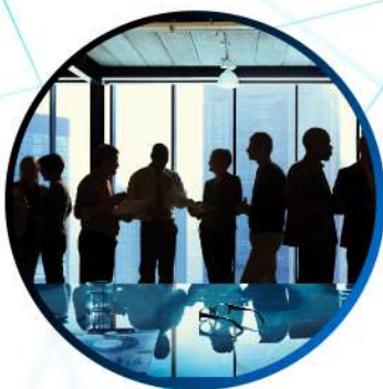
Exclusive Networking with CTO