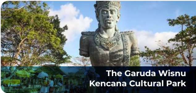
The Garuda Wisnu Kencana Cultural Park