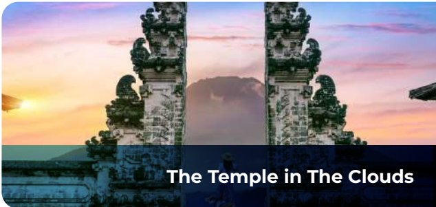
The Temple in The Clouds