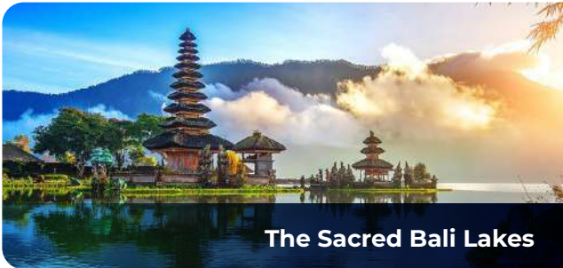
The Sacred Bali Lakes