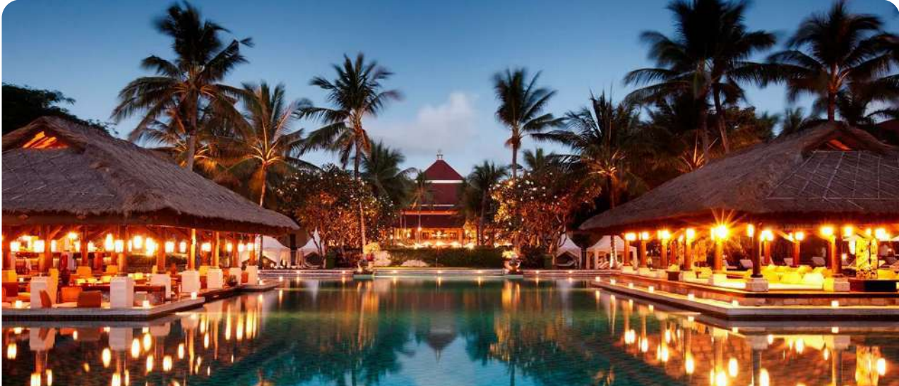
Intercontinental Bali Resort