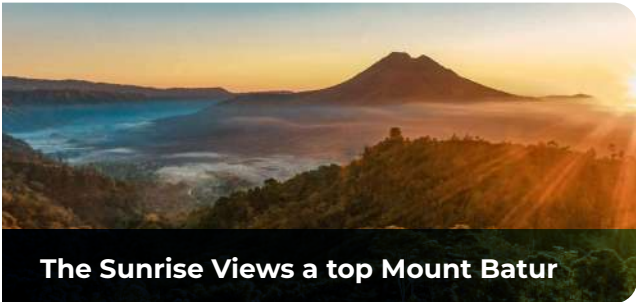
The Sunrise Views a top Mount Batur