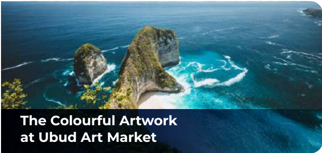
The Colourful Artwork at Ubud Art Market