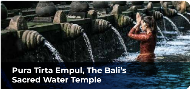
Pura Tirta Empul, The Bali's Sacred Water Temple