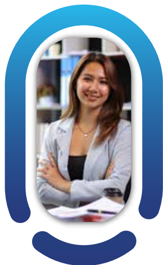
Chief Human Resource Officer

The conference has been tailored to address the key stakeholders and decision makers in an organisation, such as: