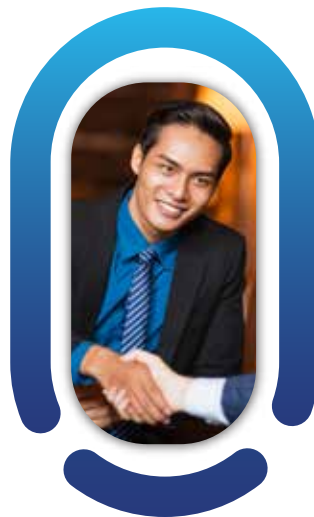
Senior HR Managers and above