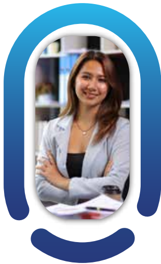
Chief Human Resource Officer

The conference has been tailored to address the key stakeholders and decision makers in an organisation, such as: