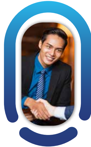
Senior HR Managers and above